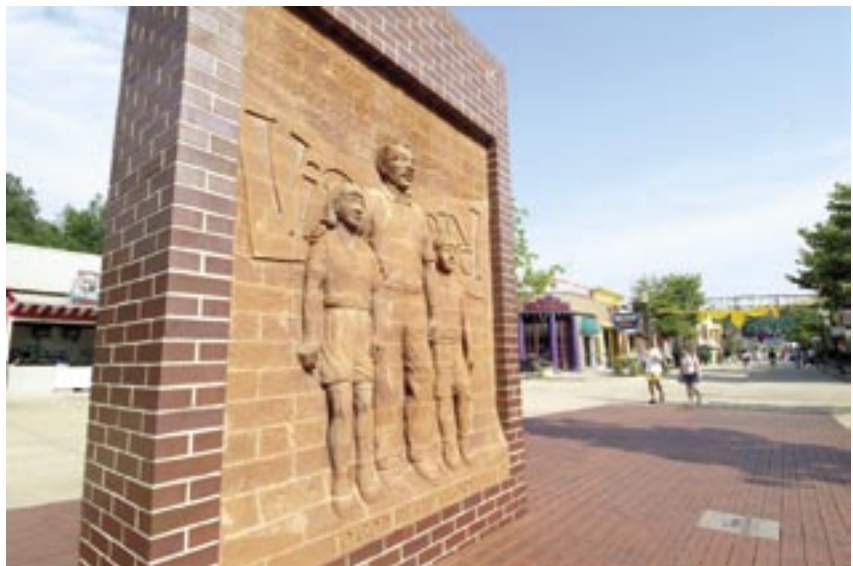
VisionLand, an amusement park founded by Jefferson County Commissioner Langford, includes this brick bas-relief of him with two children.

Jefferson County also sprinkled money around Wall Street to swap dealers that didn't directly participate in the sewer deals, according to a March 28, 2003, letter from JPMorgan Chase to Langford. The county required JPMorgan to