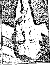
COMMENTARY BY PAAT BUCHANAN

H e said he did not want a special prosecutor. He did not want a 9-11 commission to delve into the criminality of what was